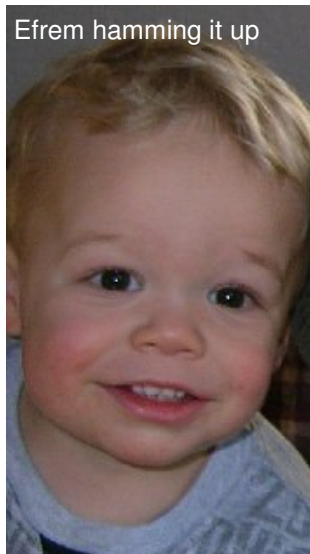
Efrem hamming it up

In November we launched a Google ad campaign to publicize www.atoi2voir.com , the French EveryStudent site. We chose five all-star articles, successful in other countries, which appeared on the right hand side of Google searches and also on other sites that use Google ads.