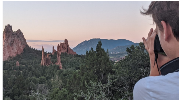
Silas taking pictures at the Garden of the Gods