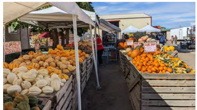
Welcome to the world of pumpkins!