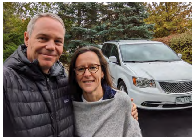
Reunited with our traveling van!